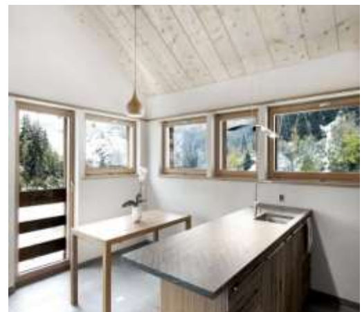
Creative space in a modernized log cabin similar in size to Guild Park's Pioneer cabin